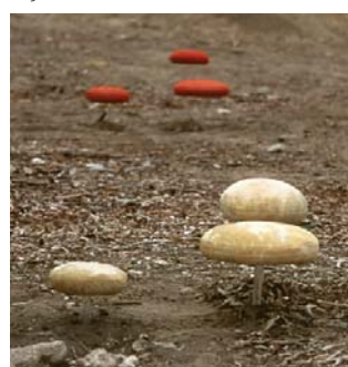
'Jurassic Martian Landscape' (detail), 2000, clay, sand, plexiglass rods, river rock, 152 x 305 m