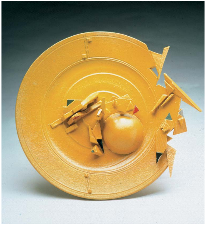
'Plane Platter, 2003, multi-fired clay, yellow slip, diam. 56 x 7.6 cm