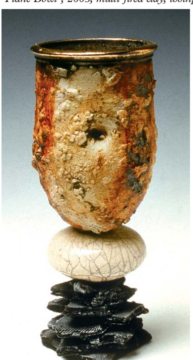
'Craggy Goblet', 2001, ceramic, ht 23 cm