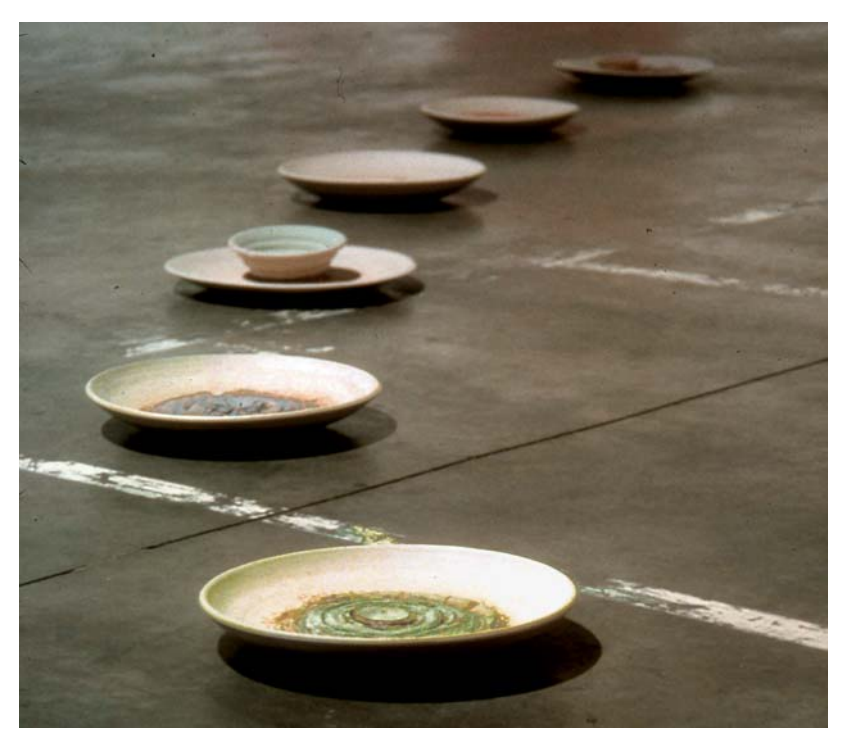
'Untitled Universeled', 2002, fired and decomposing unfired clay, coloured slips

Email: sschh@earthlink.net Web: www.home.earthlink.net/~sschh/