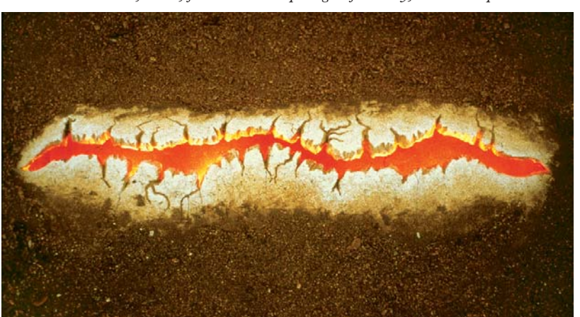
'Floor Eruption' (detail), 2000, clay, dirt, lights