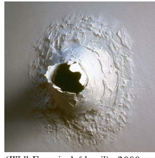
'Wall Eruption' (detail), 2000, clay, black velvet, 91 x 91 x 61 cm